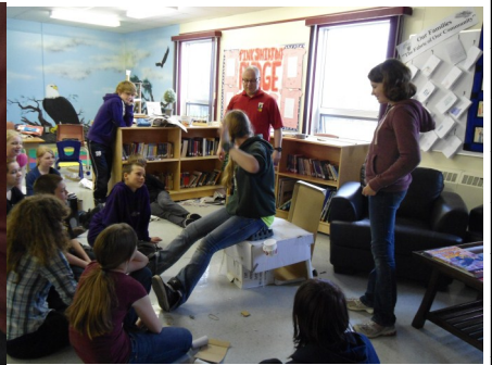
Will it hold up for 15 seconds?